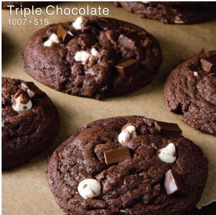
Triple Chocolate 1007 • $15