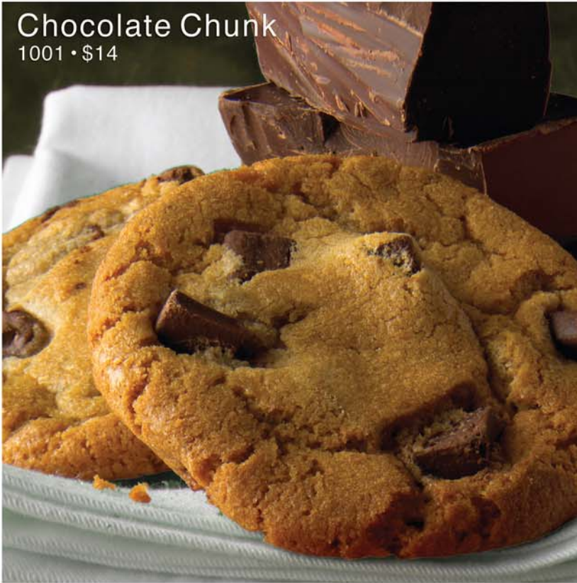
Chocolate Chunk 1001 • $14