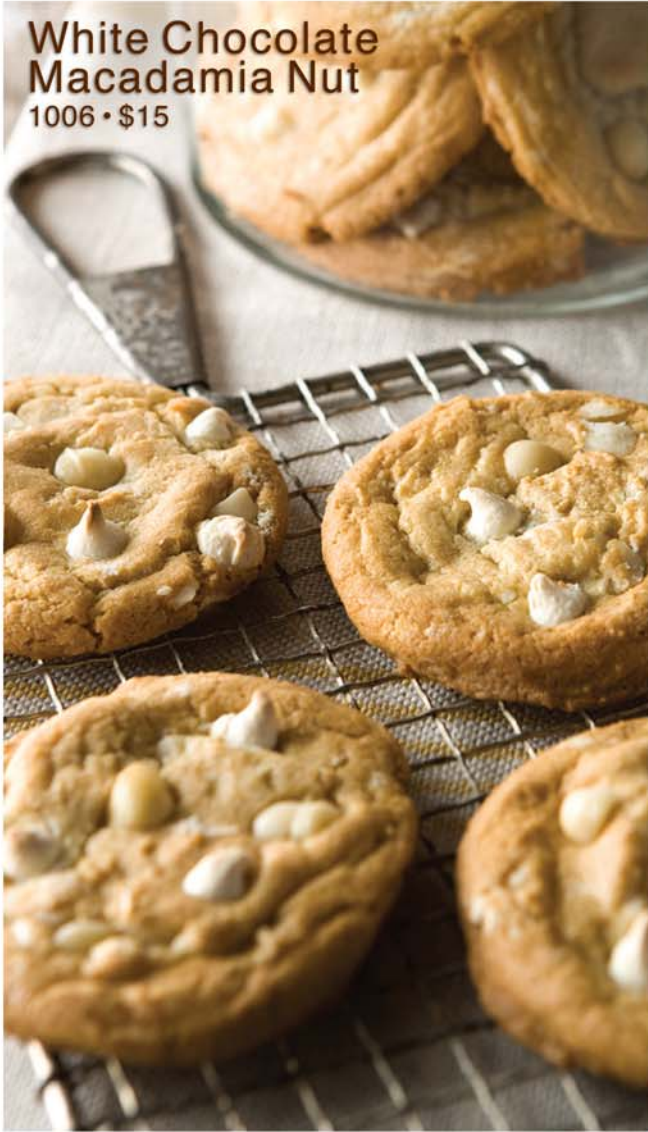
White Chocolate Macadamia Nut 1006 • $15