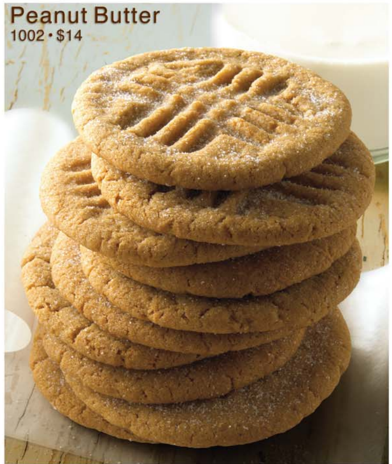
Peanut Butter 1002 • $14